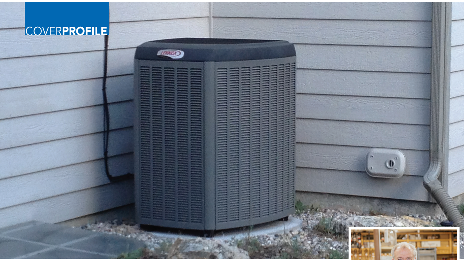
This year, with new laws on refrigerants in air conditioning units in effect as of Jan. 1, Northern Colorado Air is partnering with customers to ensure that they have the correct refrigerant for their unit.