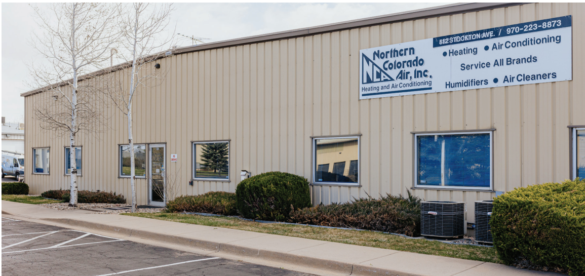
A family-owned business, Northern Colorado Air has a well-earned reputation from Fort Collins to Longmont, Windsor and Loveland.

Not only does Northern Colorado Air install and maintain HVAC systems, but they also educate customers on their options before a