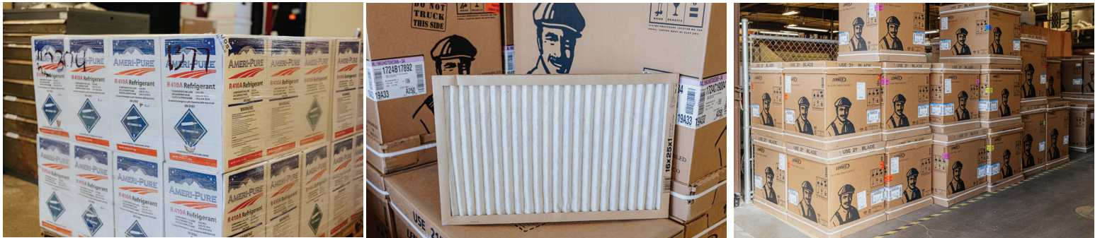
Northern Colorado Air stocks its warehouse with top-quality HVAC filters, refrigerant and supplies.

Northern Colorado Air, Inc. prides itself on offering the absolute best heating system repair, air conditioner repair, furnace installation, air conditioner installation and HVAC services. For more information about commercial and residential services, contact Northern Colorado Air, Inc. at 970.223.8873 or visit ncagriff.com.